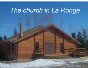
The church in La Ronge

On the Junior High mission trip to La Ronge this summer, we joined the congregation at La Ronge Lutheran Fellowship for the Sunday morning worship service. Adding 36 people into a small church where there was also a baptism and many extra visitors made for cozy seating arrangements. As we sang together, I was blessed by how heartily our youth joined in. In some teenage circles, singing is not considered to be a cool thing, but these youth sang and worshipped at the top of their lungs. In fact, I noticed a few of the other congregants looking over wondering who was singing with such conviction. I was blessed to be in the midst of a group of people who meant what they sang and were not ashamed to do that.