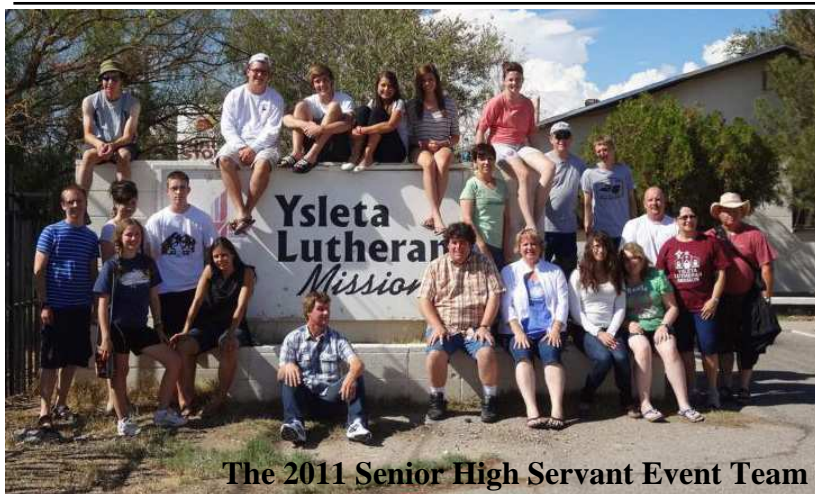
The 2011 Senior High Servant Event Team

Thank you so much for giving me the opportunity to go to Juarez and El Paso. The entire trip was filled with experiences that helped me (and I'm sure everyone else) grow physically, emotionally and spiritually. This experience and the invaluable lessons I have learned will stay with me for the rest of my life. Once again, thank you so much.