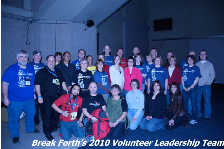
Break Forth's 2010 Volunteer Leadership Team