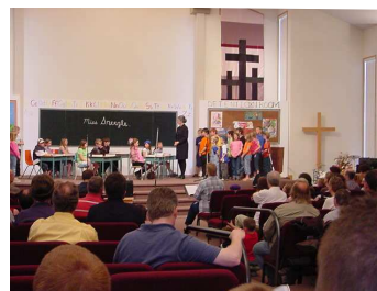
The 2005 Musical

The 47 actors and singers have been working