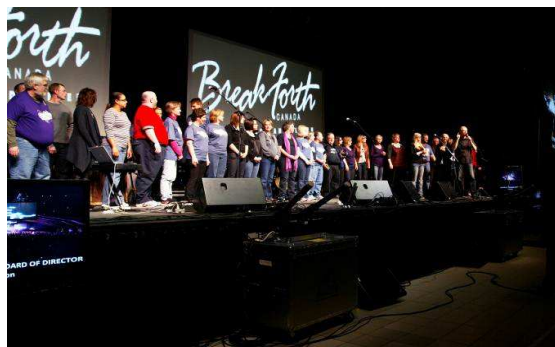
Volunteer Committee Heads and staff on Stage

“I love how Break Forth reminds me, every time I go, that I am part of a vibrant, creative, loving, beloved community of believers. It's like coming home.”