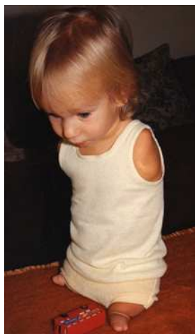
Nick at 6 years old

All you need to do is to hear Nick Vujicic speak or read his book to know the depth of his pain, and to see how the grace of God has enabled him to overcome these limitations to follow the call of God.